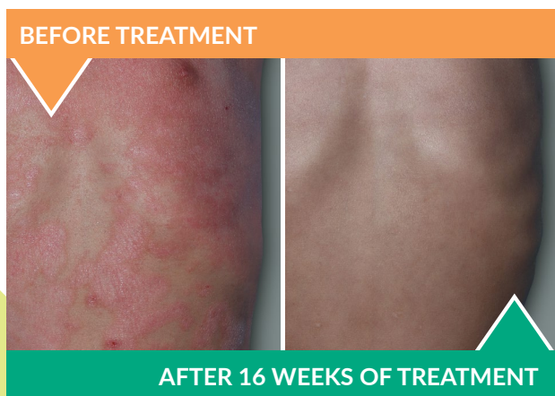
Actual 4-year-old patient in the clinical trial. † Individual results may vary.

Eczema can affect anyone, regardless of race, ethnicity, or gender, and it can appear differently on different skin types. In some cases, eczema rashes may look red, gray, brown or purple. DUPIXENT has shown generally consistent efficacy regardless of race/ethnicity in adult studies.