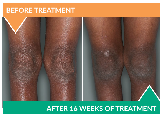
Actual 6-year-old patient in the clinical trial. † Individual results may vary.

IMPORTANT SAFETY INFORMATION: The most common side effects in patients with eczema include injection site reactions, eye and eyelid inflammation, including redness, swelling, and itching, sometimes with blurred vision, cold sores in your mouth or on your lips, and high count of a certain white blood cell (eosinophilia).