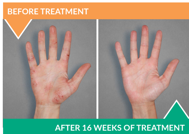
Actual adult patient.*