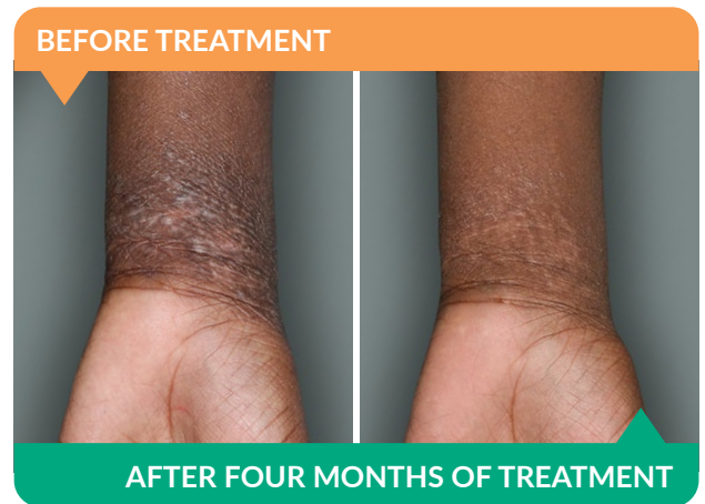
Actual 10-year-old clinical trial patient.*