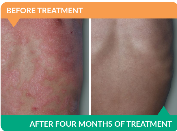
Actual 4-year-old clinical trial patient.*