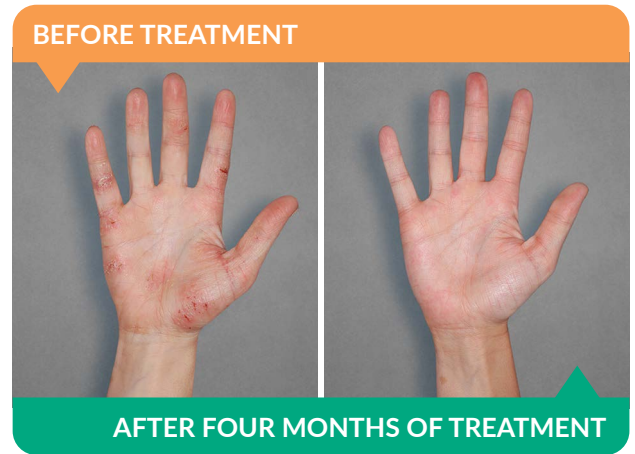
Actual, real-world adult patient. Not a clinical trial patient.†